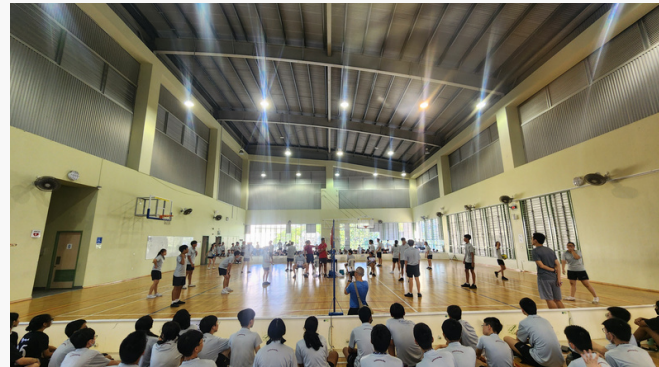
Sec 2 Inter-Class Volleyball Competition