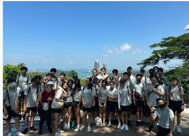
Sec 3 Southern Ridges Walk