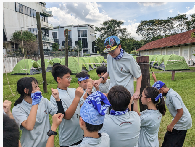
Sec 1 class bonding at CAMP STAR