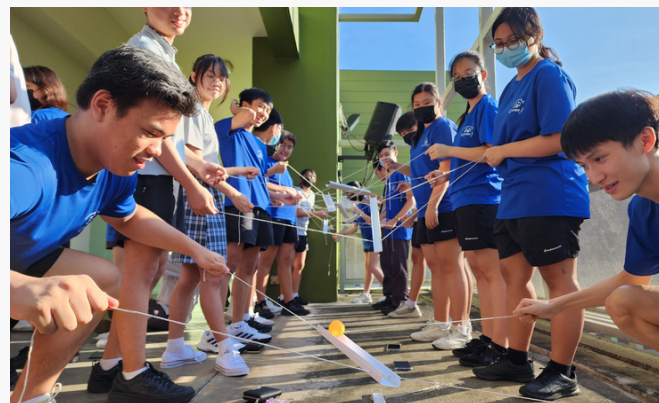
Sec 4/5 Class Cohesion Activity