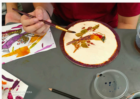
Sec 2 Batik Art Painting

Our Sec 3 North Stars took the chance to better understand the various post-secondary & career opportunities available through an industry learning journey and sharing by professionals from various industries.