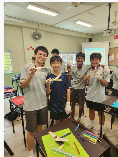
Sec 1 ALP Makers Day

Our Sec 2 North Stars picked up a new sport, such as Kinball, Bowling, Inline Skating, or Archery. Through immersive VR, they were also transported 400 kilometers above Earth into the International Space Station, when they visited the Space Explorer Exhibition. They also had a hand at creating a Batik art piece. In addition, they went through the Subject Combination Option Exercise Engagement, to help them make informed decisions at this critical juncture.