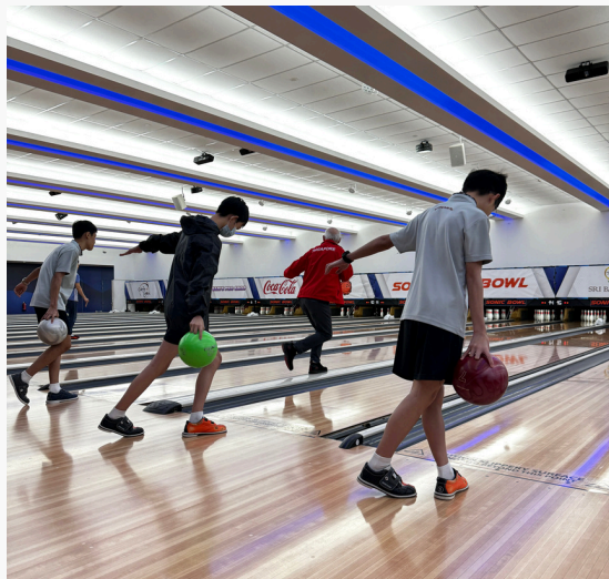
Sec 1 Sports Education Programme (Bowling)

Our Sec 1 North Stars participated in The Leadership Challenge and collaborated to complete activities like writing a word by holding ends of strings tied to a marker. They participated in sports like Kinball, Bowling, Inline Skating or Archery through the Sports Education Programme. They also showcased their creativity as they designed and created keychains during the Art Enrichment Programme. In addition, North Stars also built and flew their own gliders on the Applied Learning Programme (ALP) Makers' Day.