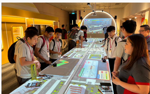
Sec 3 Industry Learning Journeys

Our Sec 3 North Stars took the chance to better understand the various post-secondary & career opportunities available through an industry learning journey and sharing by professionals from various industries.