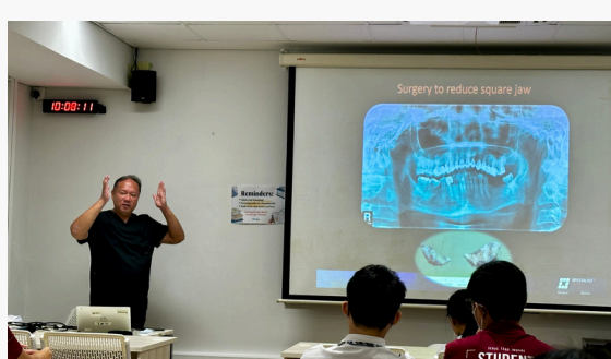
Sec 3 Sharing by Professionals