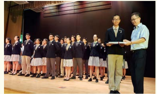
Student Council Investiture Ceremony

The programme aims to develop every student to be an exemplary leader with a strong moral compass and the vision of “Serve to Lead, Lead to Inspire”. Leadership training is based on The Leadership Challenge (TLC) model which provides practical learning experiences to raise self-awareness, develop people and leadership skills, help students find purpose in life and make a difference to others. Students realise their leadership potential through various leadership roles (Student Councillors, CCA Leaders, Class Leaders, Peer Support Leaders, CCE/Cyber Wellness Ambassadors, Environment/VIA Champions) and service to school and the community.