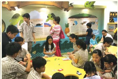
L-R: Videography Club – Champions in 2016 National Crime Prevention Council-Sengkang NPC Anti-Shop Theft Video Competition and Silver Award in 2017 Schools Digital Media Awards; Media Resource Library – Student Librarians organised Racial Synergy at Sengkang Library, engaging the community with storytelling and traditional games to promote racial harmony