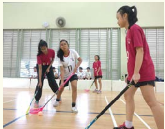
L-R: Softball – 2018 National B Boys 2nd round; 2018 DCMA Cup C Boys 2nd); Badminton – 2019 North Zone B Boys & B Girls 2nd round; Netball – 1 student selected for 2019 North Zone Under-14 Netball Squad; Basketball – 2019 North Zone B Boys 2nd Round; Floorball – New CCA since 2017