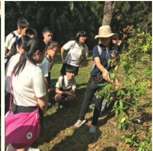
Environment Club – Members help organise and take up leading roles in our annual participation of International Coastal Clean-Up Singapore by students from various CCAs. Students interact with the Guest-Of-Honour, Mr Teo Chee Hean, Senior Minister and Coordinating Minister for National Security, at the North East Clean and Green Carnival 2018. Members are also trained by NEA & PUB in conducting learning trails and outreach activities for the community such as through a learning journey to St John's Island to learn about the natural flora and fauna. The school has achieved Singapore Environment Council Vanda Miss Joaquim Award (formerly Lotus Sustained Achievement Award) – the highest accolade under the Schools Green Awards, North East CDC Environment Award (Secondary Schools and Individual Categories), NEA 3R Gold Sustained Achievement Award, PUB Watermark Award and Water Efficient Building Silver Award