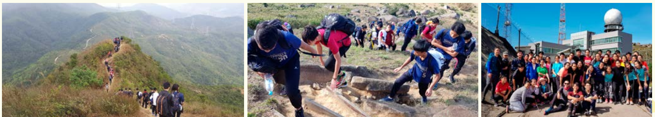
Leadership development/cultural immersion to Hong Kong in 2017 & 2018 for UG/sports CCA. Students will be going to Bandung, Indonesia in 2019