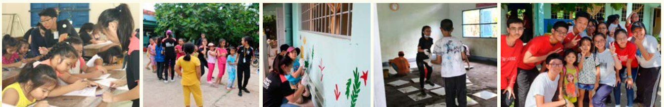
Overseas Service Learning Programme 2019 - 5 days of service learning project with An Khanh Primary School in Ho Chi Minh City, Vietnam