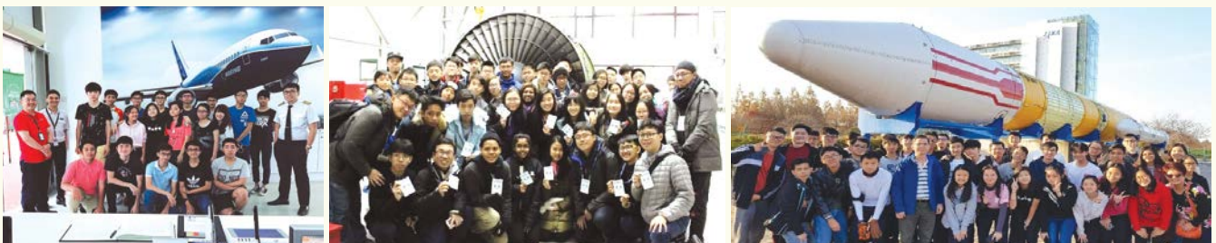
L-R: Aviation and Aerospace AEM at Temasek Polytechnic; Overseas aeronautics learning journey to China Beijing/Tianjin in 2017 and to Japan Tokyo/Matsumoto/Nagoya/Osaka in 2018