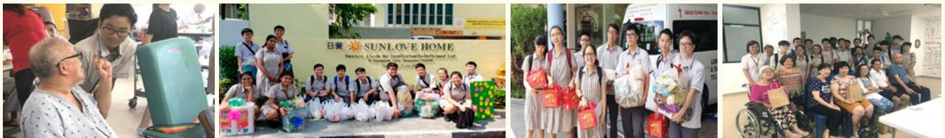
L-R: Interacting with residents of Bright Hill Evergreen Home; Delivering warmth and goodies to the residents and elderly at Sunlove Home, Ling Kwang Home and Bethesda Care Seniors Activity Centre