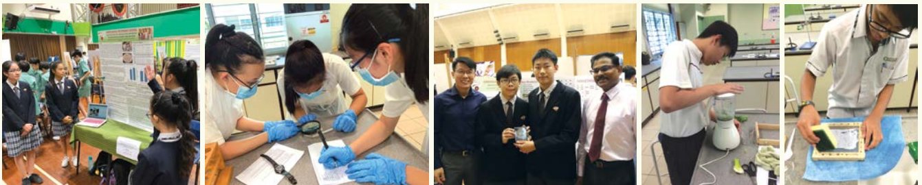
L-R: 2019 Elementz Science Research Competition organised by Anderson Sec (Gold Award); 2019 International Elementz Science Research Conference & Exhibition organised by Anderson Serangoon JC (Bronze Award)