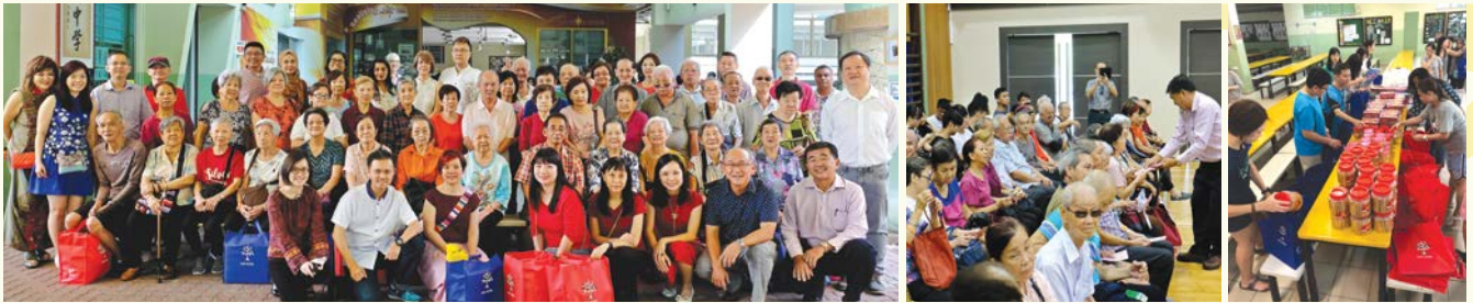
L-R: SAC, PSG and Alumni members at 2019 Chinese New Year celebrations; SAC Chairman giving out hongbaos to the elderly guests; PSG members helping to prepare items for CNY goodie bags sponsored by them

Our School Advisory Committee (SAC) , Parent Support Group (PSG)/parent volunteers and CVSS Alumni/former students play an important supportive role in 'realising the star within' every North Star. One of the highlights in which all of them play an active part is our annual Chinese New Year celebration. SAC members turn up to support the event and SAC Chairman gives out personal hongbaos to around 40 invited elderly guests each year to make their day and add to the joyous atmosphere. PSG members help host our elderly guests, including sponsoring, preparing and giving out generous gift hampers to all of them. Alumni members take part in the concert in various ways to add to the festive mood. The involvement and support of SAC, PSG and Alumni members provide a good example for our students and exemplify the spirit of giving and contributing to the school and community.