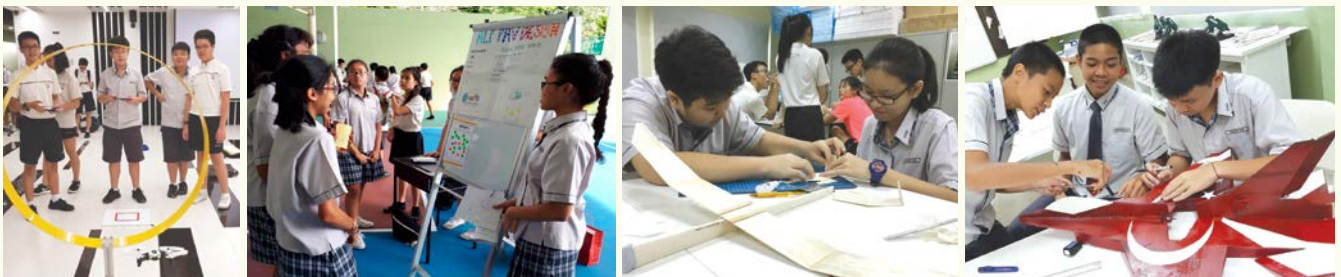
L-R: Test flying drone at Ngee Ann Poly AeroChallenge; Sharing personal aerial vehicle designs at our annual ALP Learning Festival; Building an unpowered glider at an enrichment workshop; Preparing remote-controlled plane at annual Singapore Amazing Flying Machines Challenge

Aeronautics in Curricular & Co-Curricular Programmes – Students link the theories they learn in Science and Physics to real world applications in the aerospace industry. They also attend various aeronautics enrichment workshops, aeronautics Elective Modules/Advanced Elective Modules conducted by ITE/polytechnics and go on local and overseas learning journeys to air shows, aeronautics institutions and companies (China in 2017, Japan in 2018 and 2019). Talented students take part in aeronautics competitions such as the annual Singapore Amazing Flying Machine Competition and Drone Odyssey Challenge organised by the Singapore Science Centre, Republic Polytechnic's Glider Fest etc, to develop creative problem-solving skills through a series of challenging tasks. They also join the Aeronautics Club or NCC (Air) CCA, to learn more about advanced aeronautical applications such as drone programming and aerial mapping. Our school is also on board the CAAS 'Aviation in School' initiative and is a partner of Rolls Royce where students can look forward to many exciting learning opportunities in aeronautics.