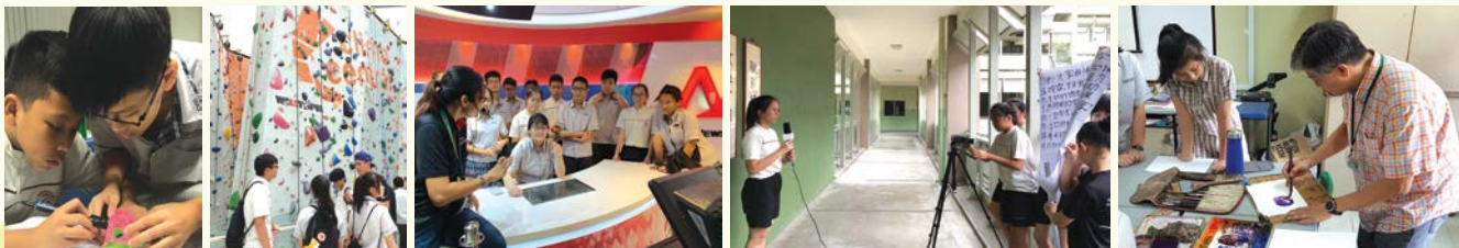
L-R: Students using 3D pen to learn about perspective and geometry in Math; Solving real-world Math problems at Kallang Sports Club; MTL Learning Journey to Mediacorp to observe how language is used in the real world; Sec 2 students engaged in "Basic Journalism" under the Lower Sec CL Oracy Programme; Sec 3 Art students learning advanced watercolour painting from a professional artist under the Artist Mentor Scheme 2018