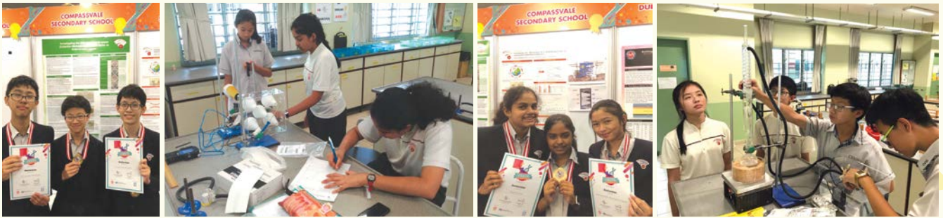
L-R: 2018 Singapore Youth Science Fair co-organised by Science Teachers Association of Singapore and Science Centre (Highest Distinction Awards for 2 teams in Lower Sec Category)