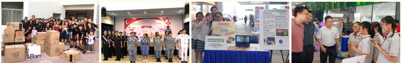
L-R: Sengkang Central Canned Food Collective Drive with grassroots volunteers; Contingent comprising members from all our 5 uniformed groups at Sengkang CC PAYM National Day Observance Ceremony; Environment Club presenting their project on upcycling plastic wrappers at the 2019 NECDC G!nnovation Challenge, which has attracted the interest of ActiveSG to bring the idea further forward

All our students embark on various level-wide VIA projects every year to serve the community. These include community projects/events with Sengkang CC and North East CDC, environmental projects under our Green Compass Programme for all Sec 1 and 2 students, student-initiated/student-led service learning projects for all Sec 3 students with Bright Hill Evergreen Home, Sunlove Home, Association for Persons with Special Needs (APSN) and Bethesda Care Services, and annual Overseas Service Learning Programme (OSLP) to Vietnam for student leaders. In 2019, a new CCA, Community Youth Leaders (CYL) Club, will be formed to cater to students with a strong passion for community service.