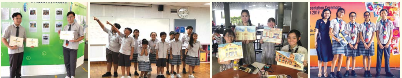
L-R: 2019 Chinese Creative Writing with Photography Competition organised by Hokkien Huay Kuan and Lianhe Zaobao (2nd, 3rd and Consolation prizes); 2019 National Schools Literature Festival (1st - Book Trailer); 2018 National Junior Watercolouring Competition (On-The-Spot Painting) (Consolation Award); 2019 Singapore Philatelic Museum National Stamp Collecting Competition (1 Gold Award with Special Prize, 1 Silver Award)