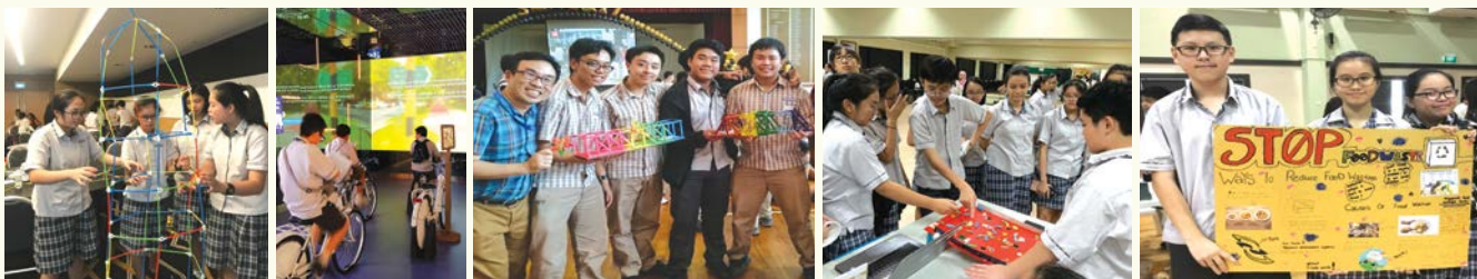
L-R: Students attending an engineering workshop at WorldSkills Singapore. Our alumni have achieved stellar results in WorldSkills competitions in the past few years and our school will be one of ten schools hosting an ASEAN delegation each for a cultural exchange programme when Singapore hosts the International Worldskills competition in July 2020; Lower Sec students engaging in SOLE (Science Outdoor Learning Experience) at Sustainable Singapore Gallery, Marina Barrage; Participation in 2017 South Zone Centre of Excellence D&T Bridge & Car Race Competition; Lower Sec Project Work Carnival - Managing Food Waste and Energy Sustainability