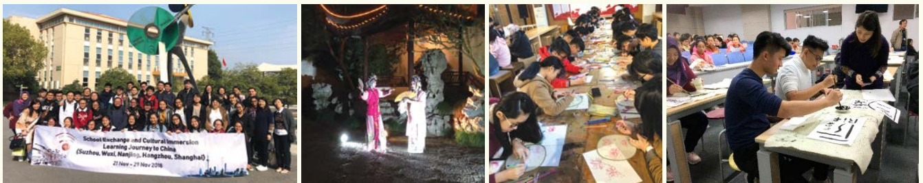
School Exchange/Performing Arts/Cultural Immersion trip for performing arts CCA to China Suzhou/Hangzhou/Shanghai, including attachment to two twinning schools – Suzhou Industrial Park Xinggang School and Changshu Foreign Language Middle School