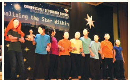
L-R: Choir – performing at 2016 SYF celebrations @ Esplanade (Certificates of Distinction in 2015, 2017 and 2019 SYF Arts Presentations, the Choir will be involved in MOE choir item for NDP 2020); Concert Band – (Certificate of Distinction in 2017 SYF Arts Presentation); Drama – (Certificate of Distinction in 2015 SYF Arts Presentation)