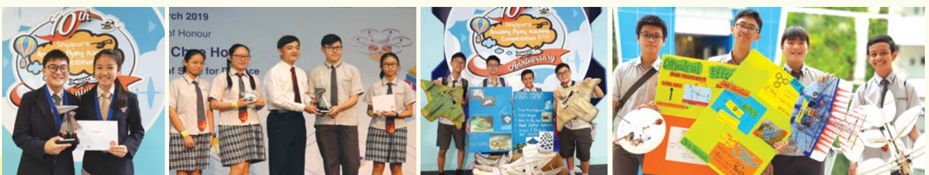
L-R: Our school swept a total of 8 awards in various categories in 2018 Singapore Amazing Flying Machine Competition and again in 2019 - Our winning teams for the Unpowered Gliders in 2018 & 2019 (Champions both year); Our Fixed-Wing Radio Controlled Flight (3rd in 2018, 2nd in 2019)