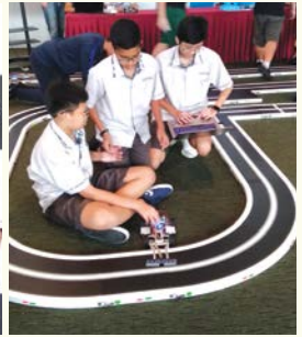
Infocomm Club (PA/AVA/Robotics) – Champions in 2018 and 2019 Nullspace Science IDE (Innovation, Design & Engineering) Robotics Competition; ITE Robotics Challenge 2018 (Merit) and 2017 (1st and Merit for Line Tracing and 3 rd for Obstacle Challenge); 2019 Republic Polytechnic Renesas Grand Prix Competition (2 nd )