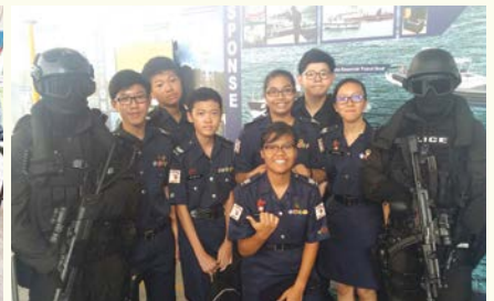
L-R: Red Cross Youth – (2018 Gold Excellent Unit Award for the 14 th consecutive year & 2017 RCY Director's Award); NCC (Air) – (2018 Unit Recognition – Distinction and two Outstanding Cadets Awards); NPCC – (2016-18 Gold Unit Overall Proficiency Award, 2017 SPF-NPCC Badge & Best Unit Cadet – 2 awardees)