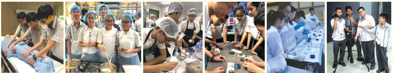
L-R: Hands-on learning at NUS Alice Lee Centre for Nursing Studies; NYP Advanced Elective Modules in Food Science & Culture, Technology for the Futuristic Smart Home and Pharmacy Trails; ITE Elective Module in Video Production