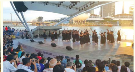
L-R: Boys' Brigade – (2018 Silver JM Fraser Award for Unit Excellence, 2018 Best Boy Award, 2017 BB Founder's Award & Best Boy Award); Girl Guides – (2017-18 Gold Puan Noor Aishah Award); Dance – performing at 2016 SYF Celebrations @ Esplanade (Certificate of Distinction in 2015 SYF Arts Presentation)