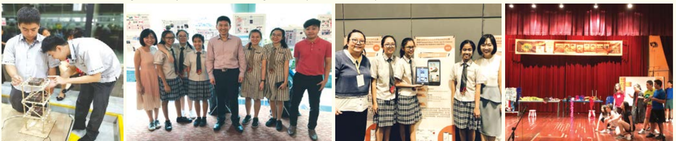
L-R: 2019 Singapore Poly National Earthquake Competition (Merit Award); 2018 CPCLL/SPH National Create Your Own Newspaper Competition (First Position & Most Popular Award (Lower Sec) and Second Position); 2018 National Chinese Mobile App Development by Students for Students Competition (Excellence Award); 2018 Dunman High School Inter-school Theatresports Competition (Most Creative Award)