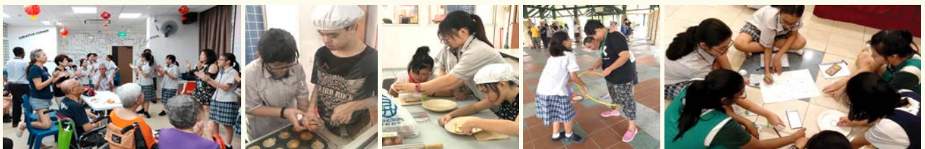
Community Youth Leaders Club - Celebrating CNY with the elderly at Bethesda Care Seniors Activity Centre; Conducting cooking lessons and telematch games with MINDS (AMK) students; Attending design thinking workshop organised by Singapore Kindness Movement